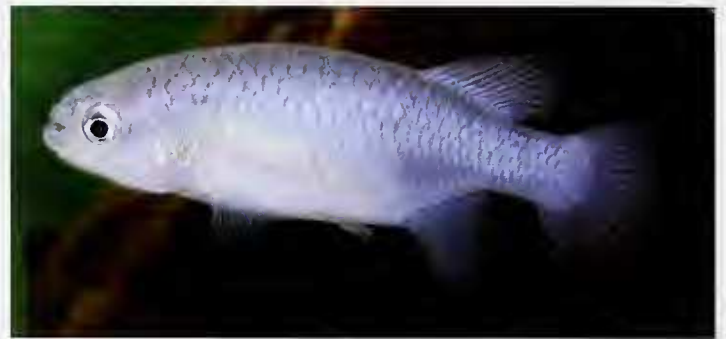
Fig. 2. Nothobranchius seegersi , adult female, not preserved, Tanzania, seasonal pool on right side of the main road T8 from Ipole to Rungwa, near Mabangwe village.

Diagnosis. Nothobranchius seegersi males share with the other members of the N. neumanni species group a combination of colouration characters, which distinguish them from all other species of the genus: caudal fin red or par-